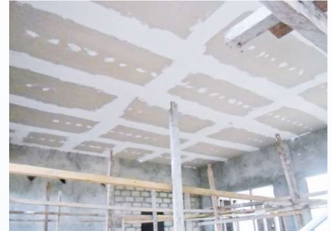
GUEST HOUSE DI PULANG ROMPANG, MALUKU