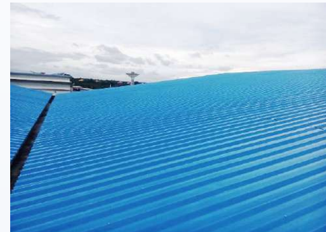
SEKOLAH TINGGI PENERBANGAN INDONESIA CURUG, TANGERANG