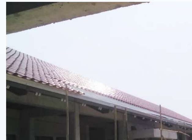
SDN 13 DUREN SAWIT, JAKARTA TIMUR