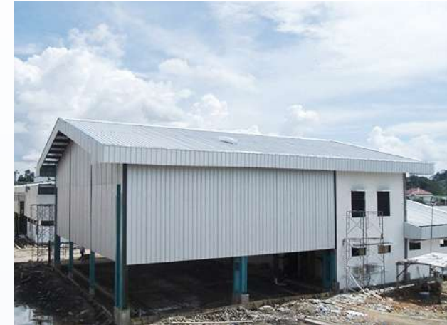
OFFICE & MESS FACILITY PT UNITED TRACTORS TBK BERAU KALIMANTAN