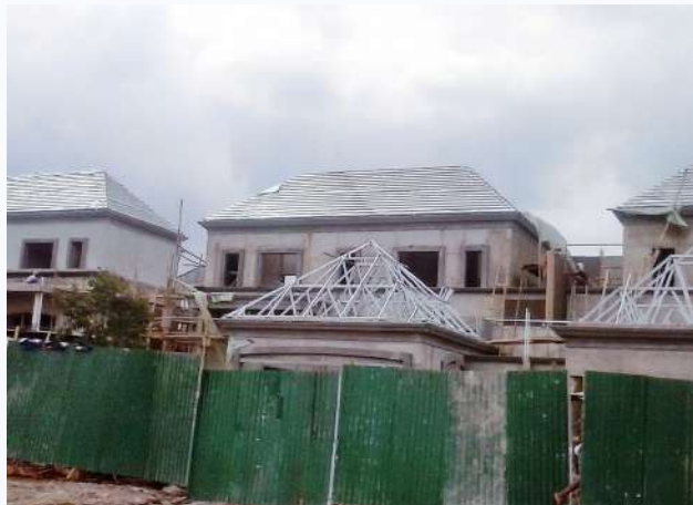
CLUSTER DE MAJA BSD CITY