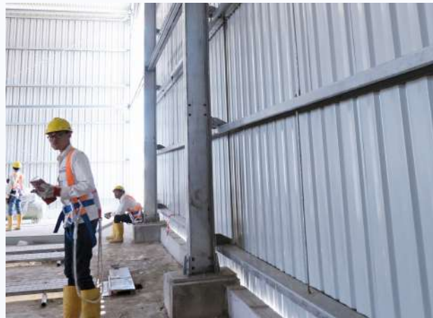
MAIN SUBSTATION BUILDING PT. MEDCO E&P MALAKA - SKK MIGAS - ACEH