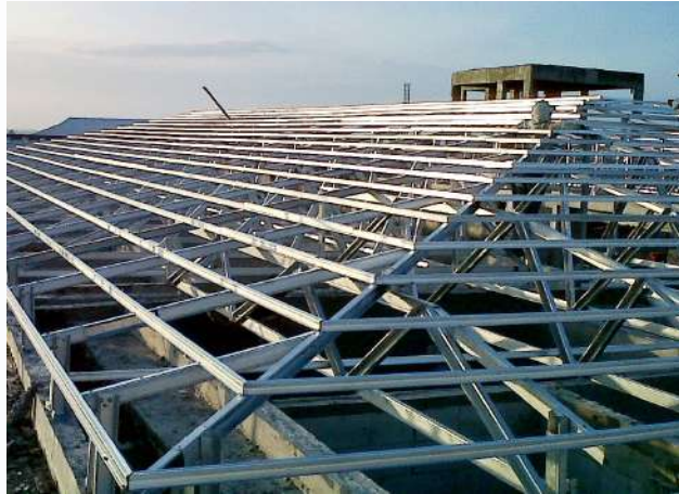
HOTEL SUNSET BALI