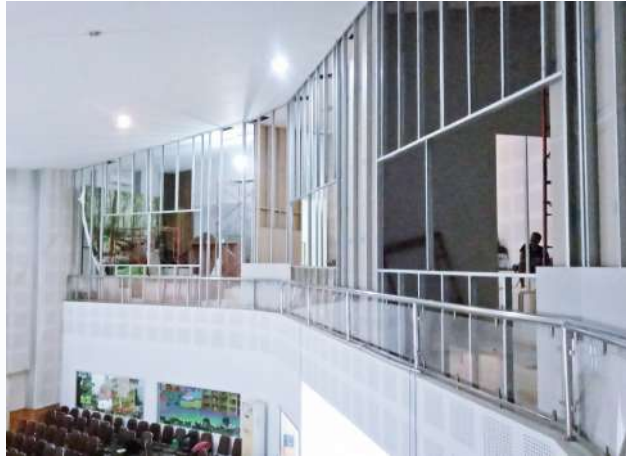
SEKOLAH KRISTEN MAKARIOS