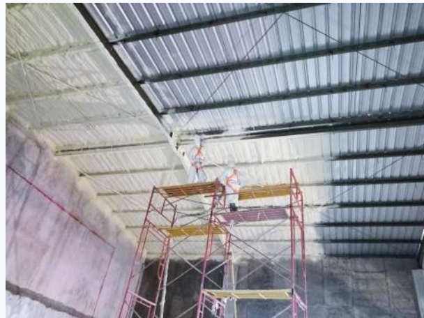
GEDUNG KEUSKUPAN BANDUNG