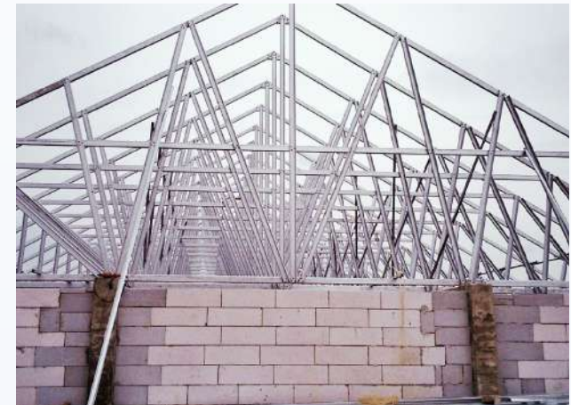
RUSUNAWA PUSDOKES KRAMAT JATI