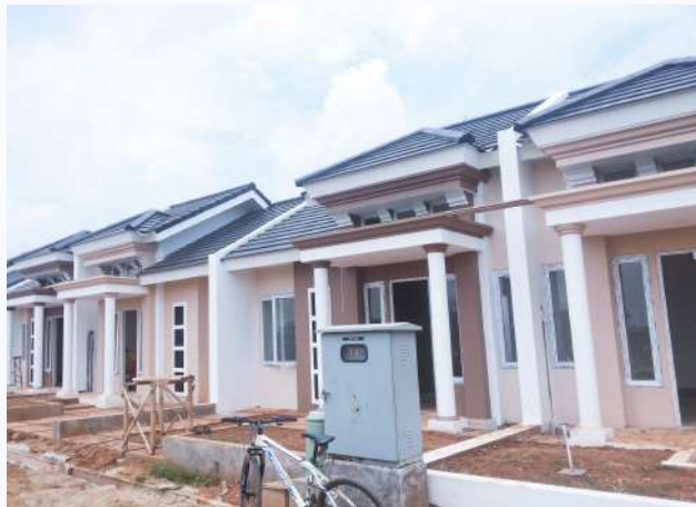
TELAGA BENING RESIDENCE, BEKASI