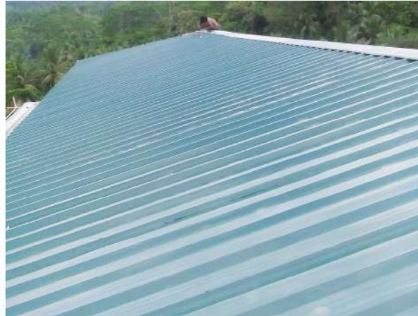
PONDOK PESANTREN PACITAN