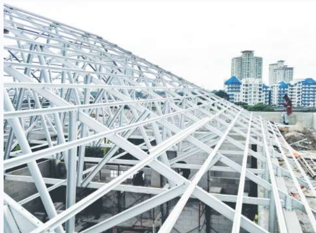
PUSKESMAS KEC. MAMPANG PRAPATAN