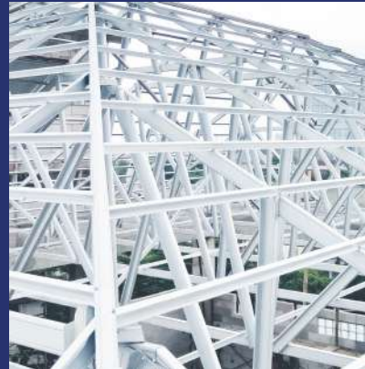
LIGHT-WEIGHT STEEL TRUSS