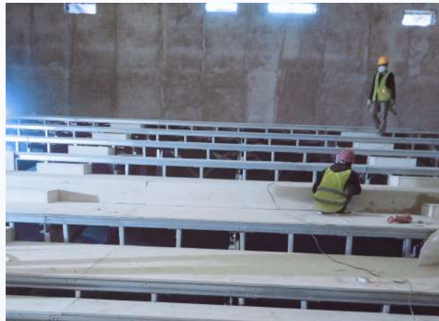
GEDUNG KEUSKUPAN BANDUNG