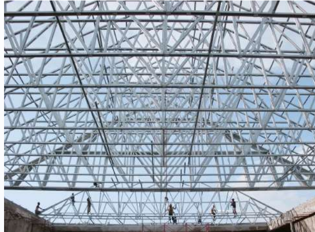
HOTEL BAHAMAS BELITUNG