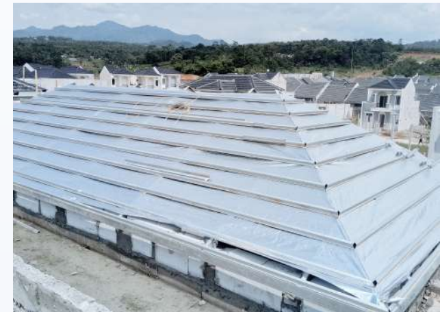
SENTUL ALAYA CLUSTER GRANDIOSO