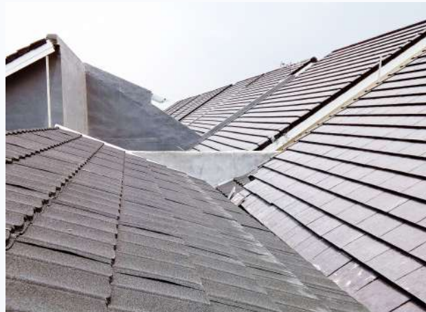
CLUSTER TAMAN SARI, BEKASI