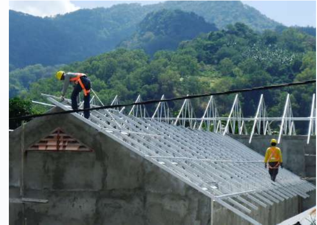
GUEST HOUSE DI PULAU ROMANG, MALUKU