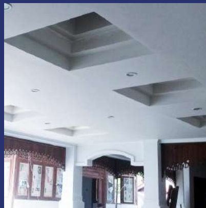
PLAFOND AND PARTITION