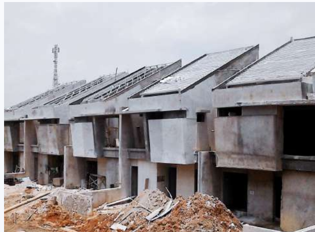
CLUSTER PRESTIGIA THE EMINENT BSD CITY