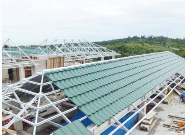
UNIVERSITAS BORNEO TARAKAN