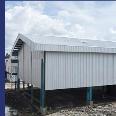
ROOFING, CADDING, AND FLOORING