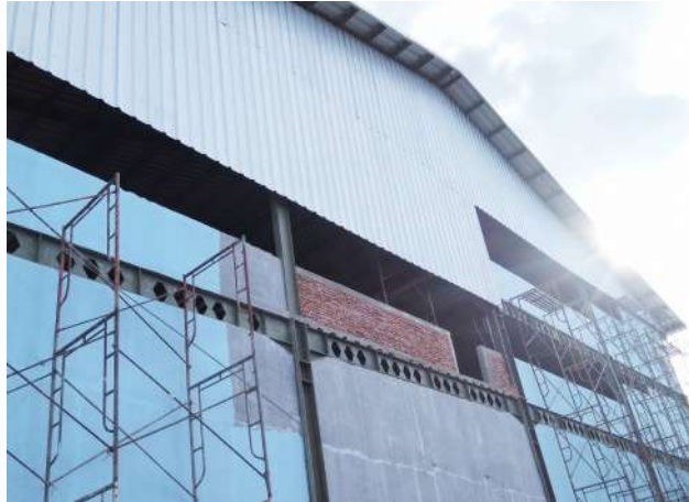
PABRIK ES MUARA BARU