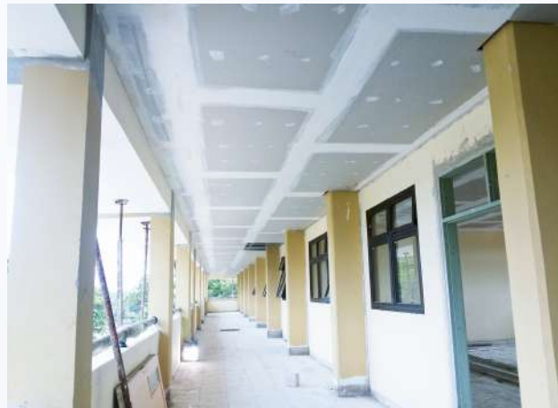
GEDUNG SMPN 172 JAKARTA